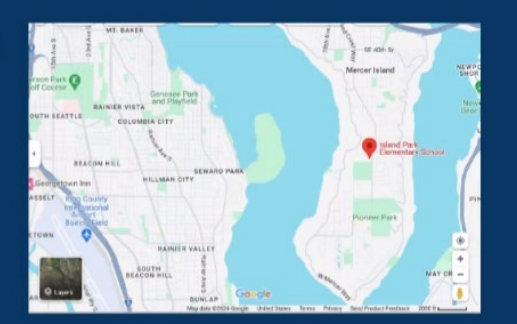
>90 dBAs at Island Park Elementary 2022 110 dBA at Genesee Park SeaFair 2024